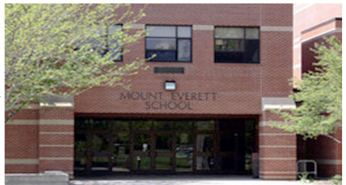
Moving On Up