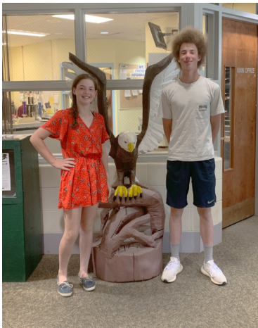
More Family Time!