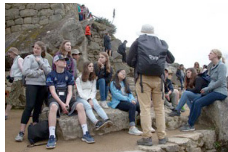
The 2019 Peru Trip kids at Macchu Picchu.