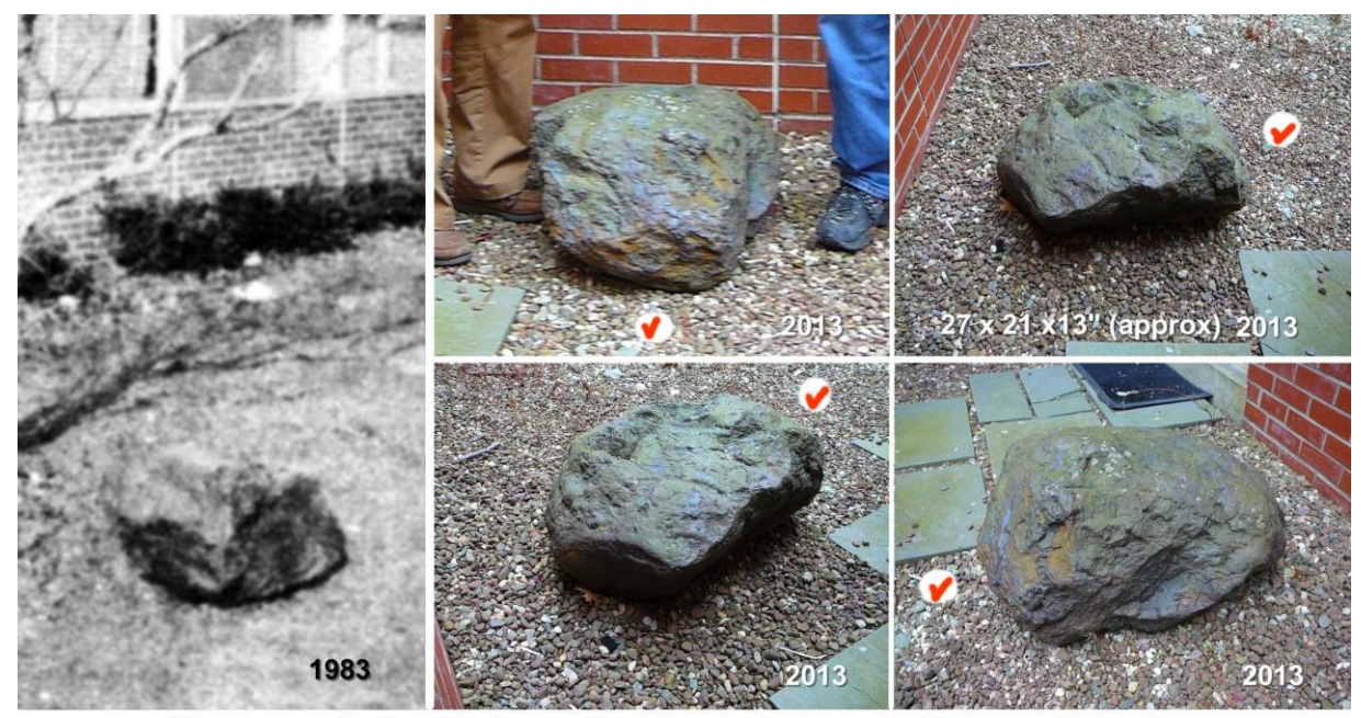
Checkmarks in the four rightmost pictures indicate orientation.