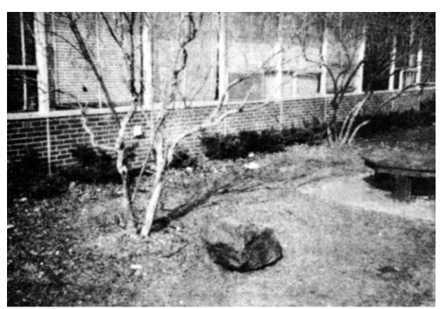
Hoffman's meteorite outside the Home-Ec room--1983

It was a short transition from senior pranks to deliberate destruction of the old Mount